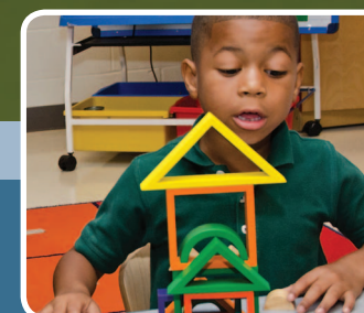
The Cox Pre-K Program at Drew Charter School

Great things are happening in East Lake everyday!