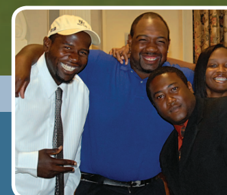
Harrison Scholarship Recipients