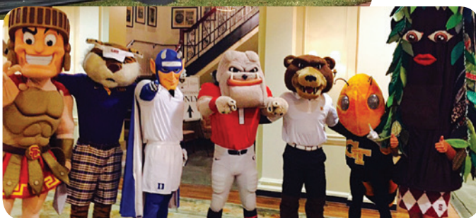
College Mascots waiting out the rain delay at East Lake Golf Club

light on the important work the East Lake Foundation has undertaken in its community and the blueprint it has provided for other communities across America."