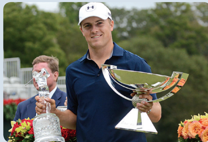
TOUR Championship and FedEx Cup winner, Jordan Spieth