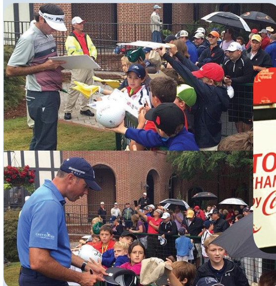
Bubba Watson (top) and Henrik Stenson (bottom) stop to sign some autographs for the kids