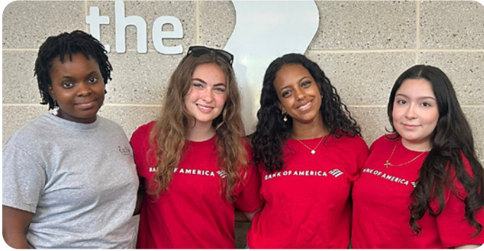
The Bank of America Student Leaders

For the 13th year, the East Lake Foundation hosted summer interns through the Bank of America Student Leaders program. The program supports rising high school seniors and college freshmen making a difference within their communities over the course of an eight-week paid internship. Selected from a pool of over 600 applicants, the Student Leaders spent their time working with several East Lake partners, including the garden at Gardenside at The Villages of East Lake and at the Sheltering Arms East Lake Center.